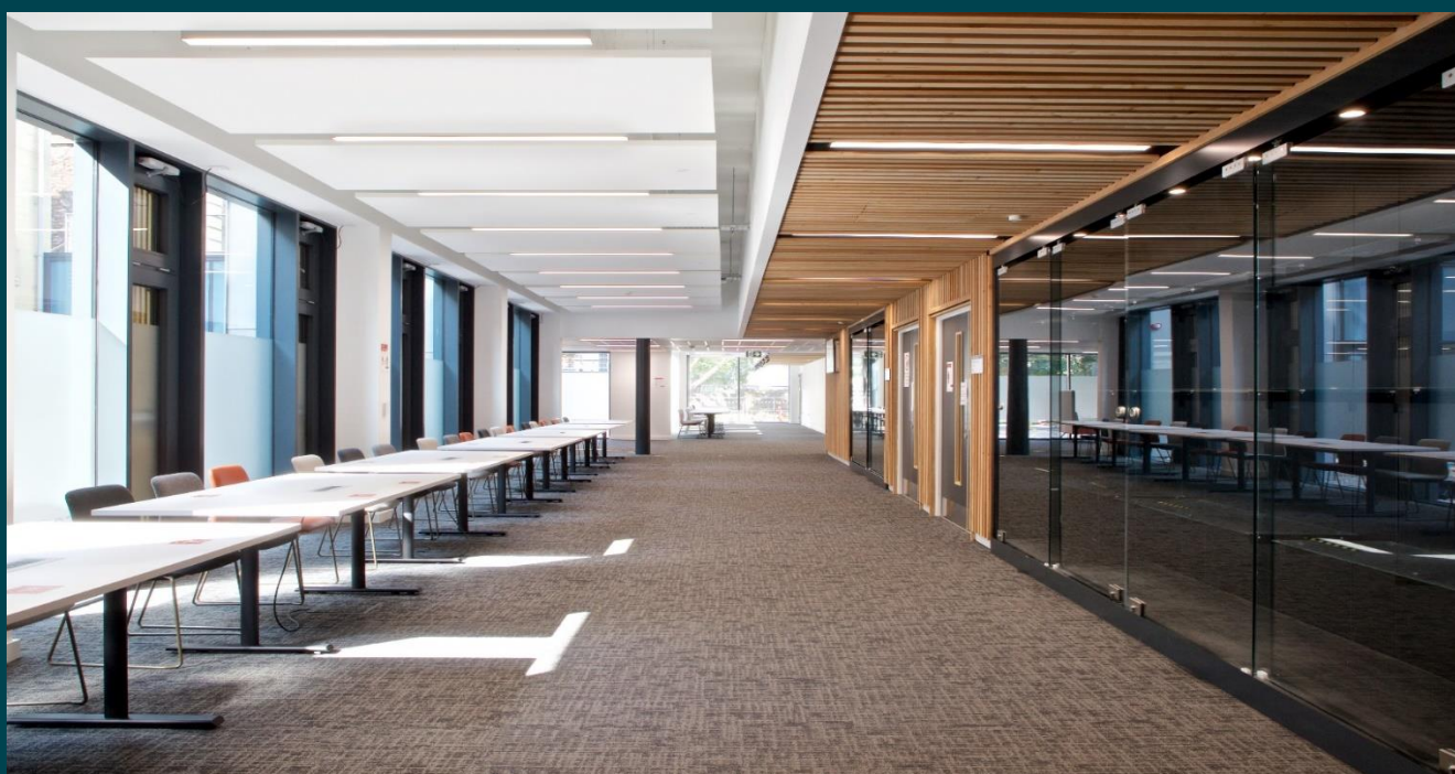
Foyer & Gallery